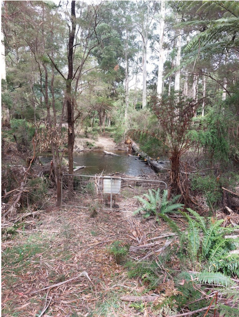
Figure 1: Ford (unmaintained) at the end of Stuart Road