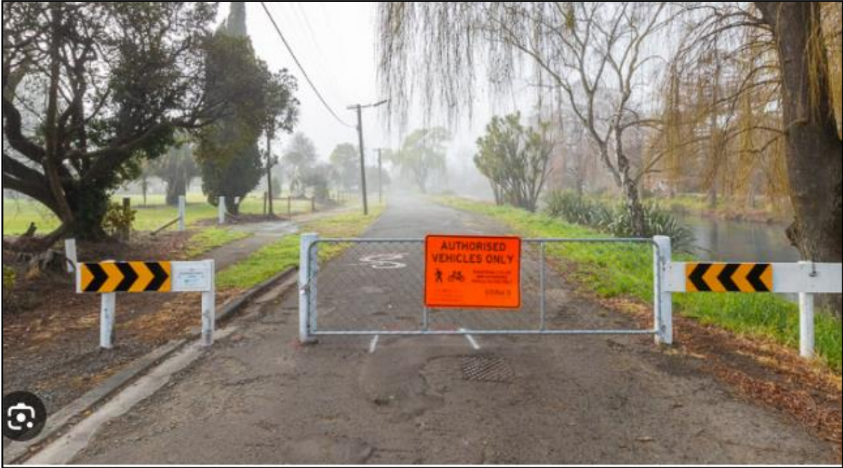
Figure 4. Typical gate treatment

Furthermore, any signage preventing pedestrian access to the road reserve needs to be removed.