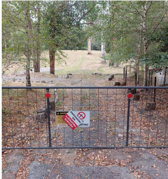
Figure 3: Signage on the gate

Locking of the gate resulted in Council receiving concerns from some residents that the gate restricts vehicle and pedestrian access to the Yarra River.